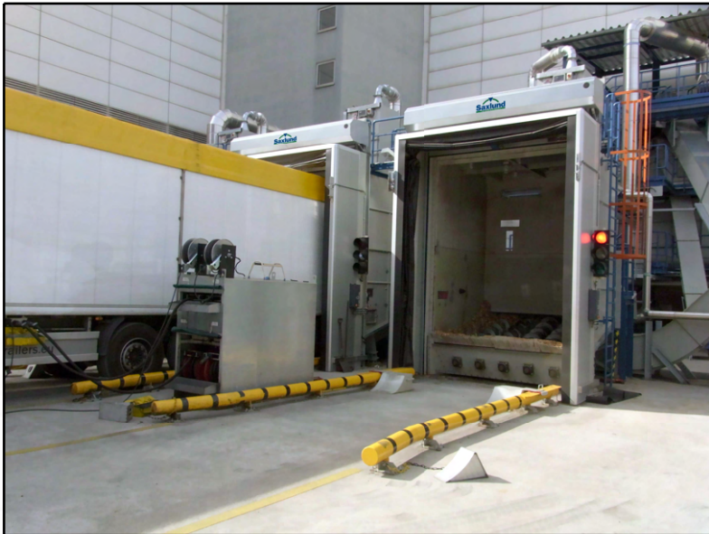
Docking of the truck trailer with the aid of light barrier-controlled traffic light signals

As an option the TDS can also be supplied with an optional hydraulic power pack to provide motive power to a walking floor trailer, which can then be used to discharge the material into the process when required, thus using the trailer as a small storage silo.