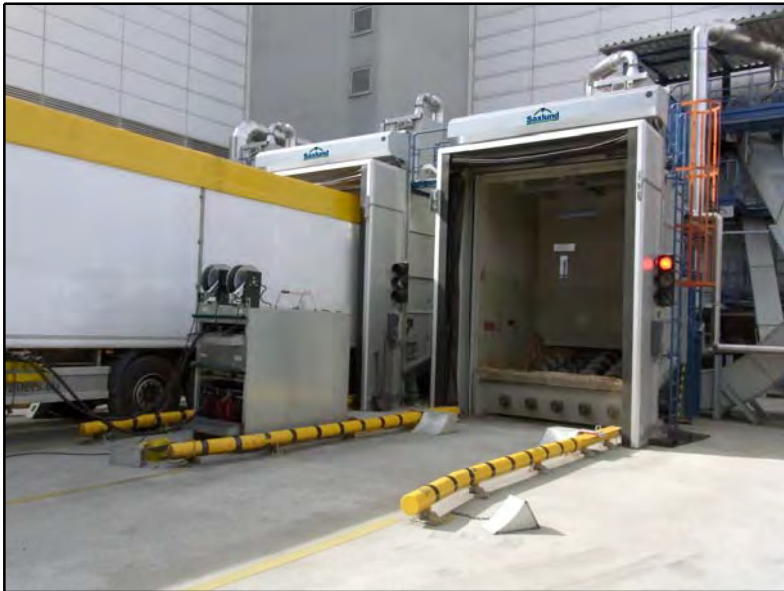
Docking of the truck trailer with the aid of light barrier-controlled traffic light signals

As an option the TDS can also be supplied with an optional hydraulic power pack to provide motive power to a walking floor trailer, which can then be used to discharge the material into the process when required, thus using the trailer as a small storage silo.